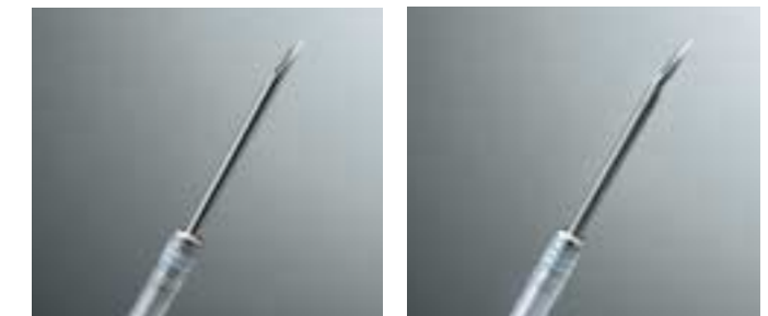
NA-401D without side-hole

NA-411D models are provided with a hole on the side of the needle shaft to draw specimens from tissues in contact with the side of the needle, as well as those at the tip.